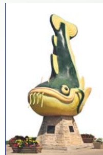
Selkirk "Catfish Capitol of North America"